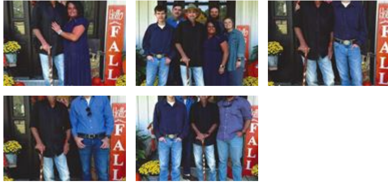
Albertville Memorial Chapel - March 10 at 04:16 PM

“ 69 files added to the album Life Tributes